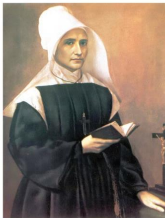
Blessed Enrichetta Dominici