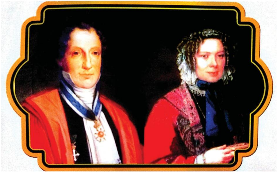
Marquis Carlo Tancredi of Barolo