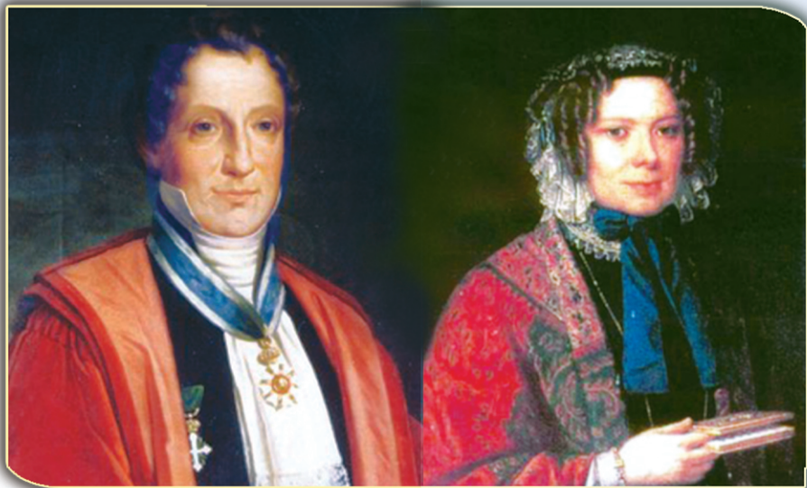
Marquis Carlo Tancredi of Barolo