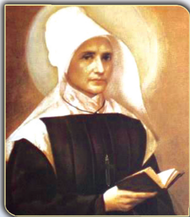
Blessed Enrichetta Dominici